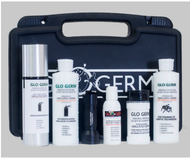
Kit pictured with Gel