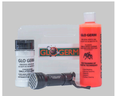
Kit pictured with Oil