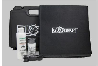
Kit pictured with Gel