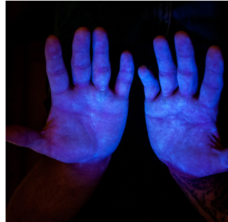
2. Hold hands under UV lamp to show “glowing germs”.