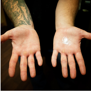
1. Apply Glo Germ Oil or Gel to hands per instructions.

TIP: Complete removal of Glo Germ with normal washing is more difficult if skin is chapped or cracked, indicating that bacteria is also harder to remove. This will require a hand care regimen with a quality lotion twice daily and a judicious use of a hand sanitizing gel.