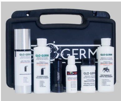
*Kit pictured with Gel