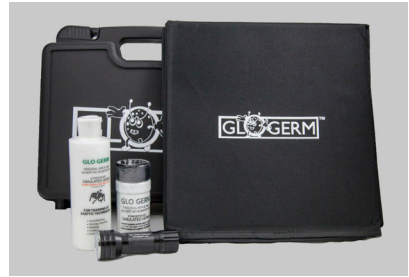
*Kit pictured with Gel

GK6G(Gel) ..... $147.50 GK6O(Oil) ..... $147.50