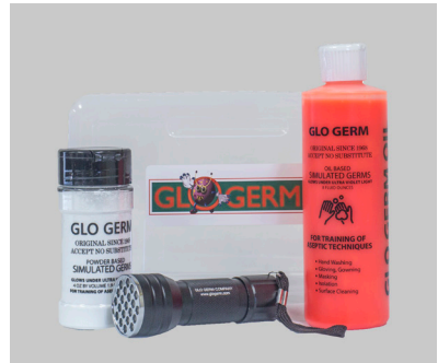
*Kit pictured with Oil

K1G2(Gel) ..... $92.50 K1O2(Oil) ..... $92.50