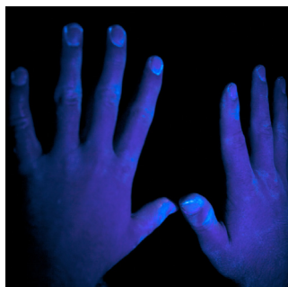
4. Check hands under UV lamp to show areas not washed properly. Pay close attention to knuckles and cuticles.