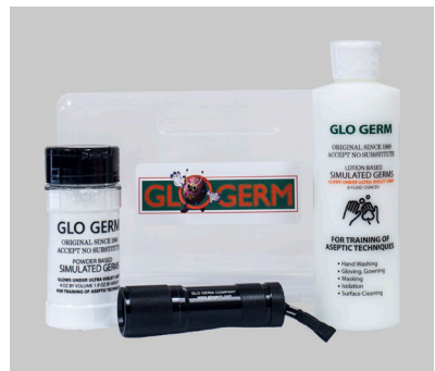
*Kit pictured with Gel

K1G1(Gel) ..... $71.50 K1O1(Oil) ..... $71.50