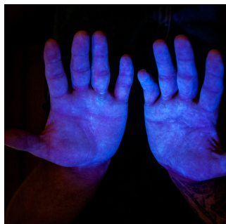
2. Hold hands under UV lamp to show “glowing germs”.