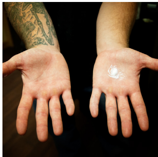
1. Apply Glo Germ Oil or Gel to hands per instructions.

TIP: Complete removal of Glo Germ with normal washing is more difficult if skin is chapped or cracked, indicating that bacteria is also harder to remove. This will require a hand care regimen with a quality lotion twice daily and a judicious use of a hand sanitizing gel.