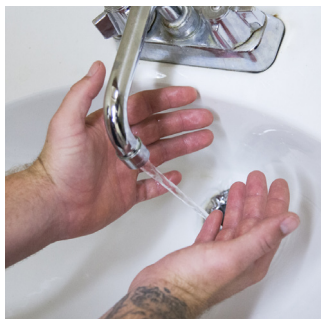
3. Wash hands with soap and water as usual.